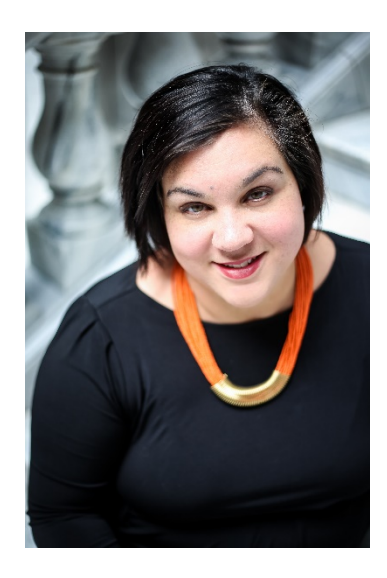
Victoria Petro-Eschler Music in Community: El Sistema in Utah